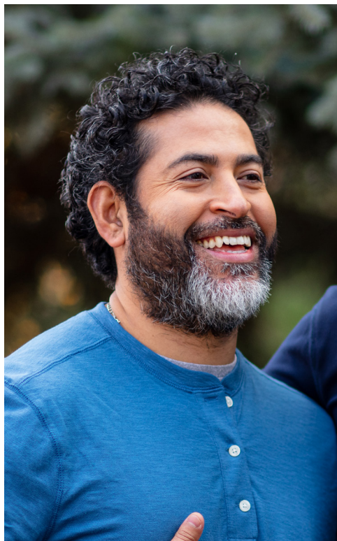
THE PERSON DEPICTED IN THIS ADVERTISEMENT IS A MODEL AND THE IMAGE IS BEING USED FOR ILLUSTRATIVE PURPOSES ONLY

The study will test if the investigational medicine (a medicine being studied) may help reduce the risk for heart disease and kidney disease on top of the standard of care treatment.